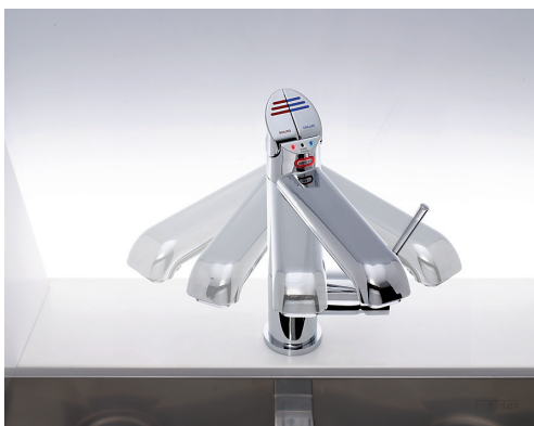
Swivel action spout services both bowls of a double-bowl sink.