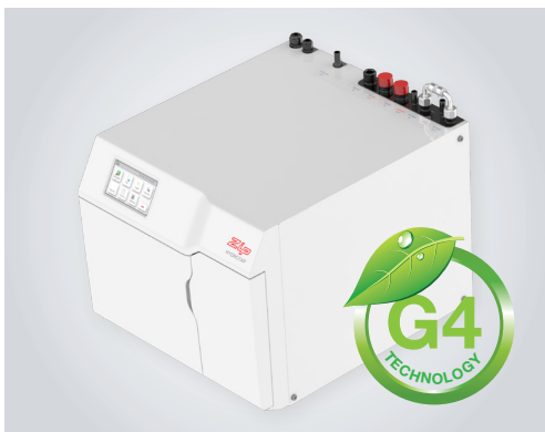
New under-sink Zip Command Centre™ leads the world in time-saving and energy-saving technology, reducing standby energy consumption by up to 55% over earlier models of similar capacity.

With new Zip G4 power-saving technology and Zip 0.2 micron filtration.