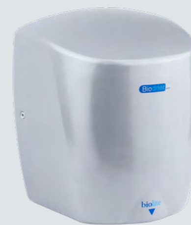
SILVER | BL09S