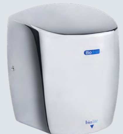
CHROME | BL09C