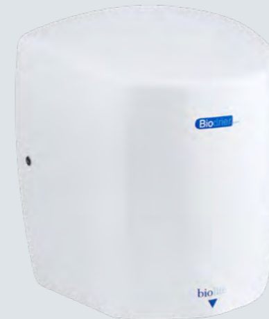
WHITE | BL09W