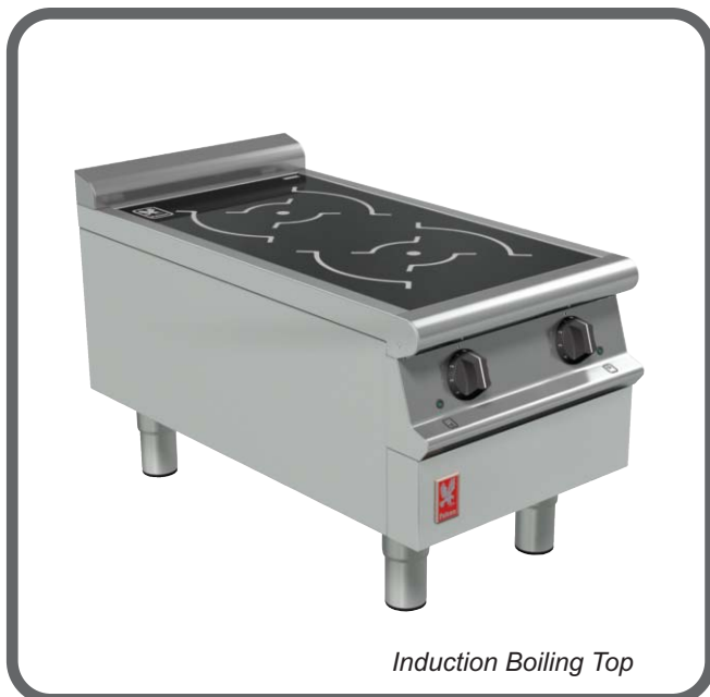
Induction Boiling Top