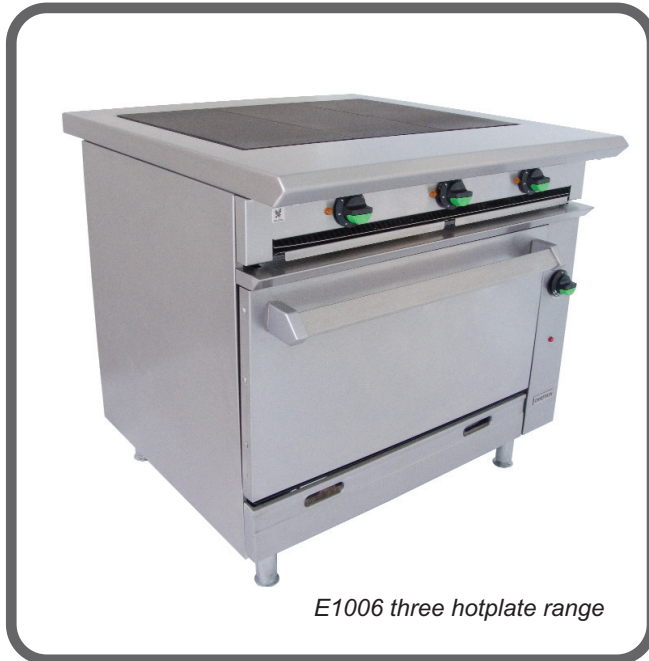
E1006 three hotplate range