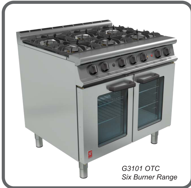
G3101 OTC Six Burner Range