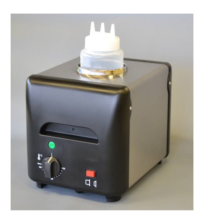
Made in France