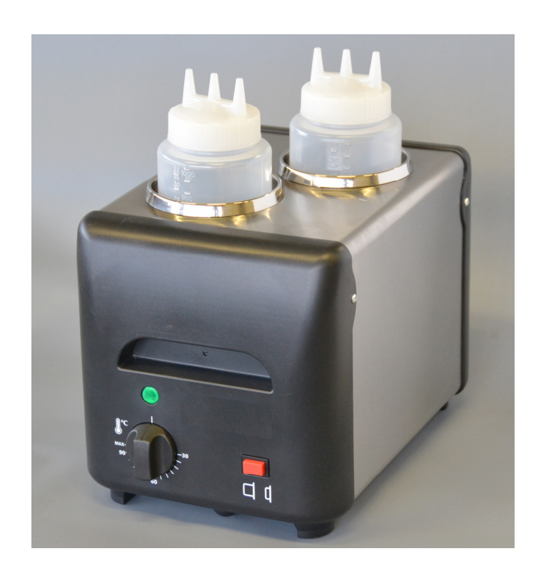
Made in France