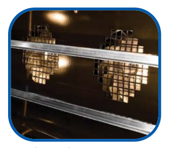
Powerful twin fans ensure even cooking