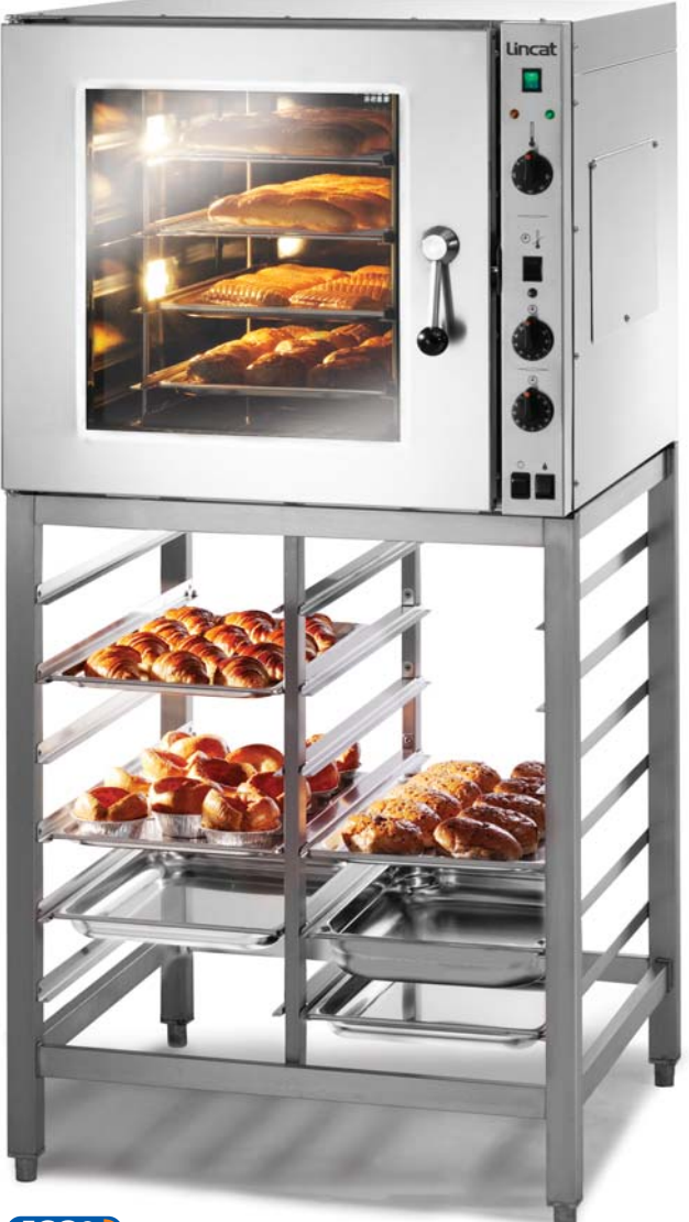
ECO9 With optional stand (ECO9/FS)