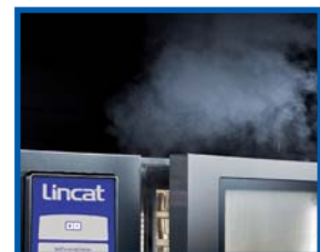
Steam generator to deliver a constant flow of fresh, hygienic steam for perfect results