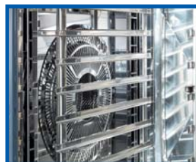
Lengthwise loading which allows 1/2, 1/3 and 2/3 GN containers to be used