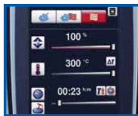
300°C maximum cooking cabinet temperature

Whether you choose an Opus CombiMaster® Plus or an Opus SelfCooking Center®, you will benefit from an exceptional build quality and a wide range of advanced features: