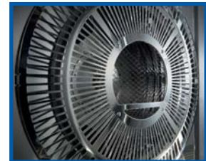
Dynamic air mixing to ensure even cooking