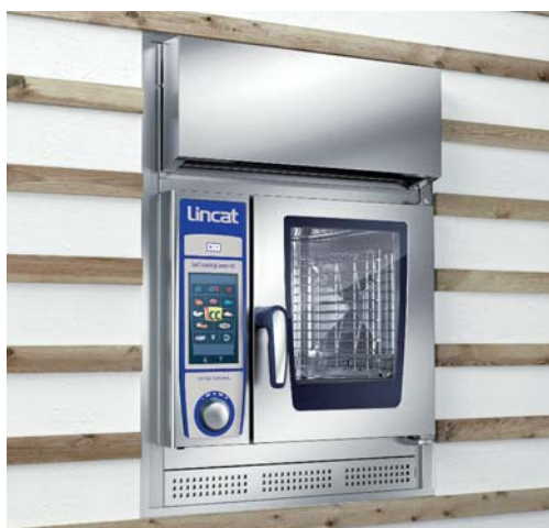
The built-in solution