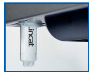
USB port to output HACCP data and upload programs and software