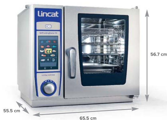
Wall mounted option

Whether it is used as an attractive front of house unit or as an additional station unit, the new Opus SelfCooking Center ® XS is the perfect solution where space is at a premium.